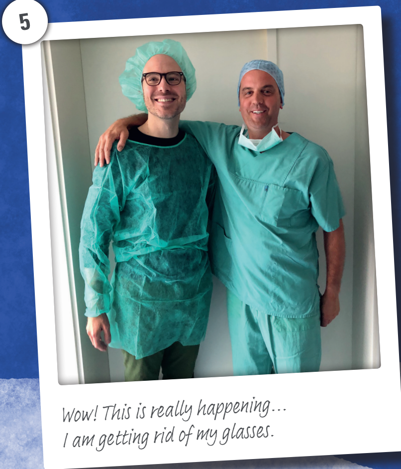
Wow! This is really happening... I am getting rid of my glasses.