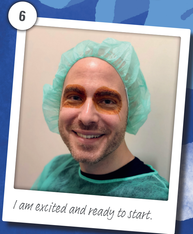
I am excited and ready to start.