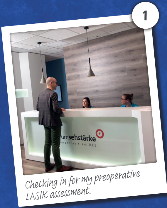
Checking in for my preoperative LASIK assessment.